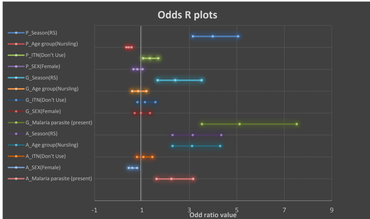
Figure 2: Odds ratios plot of the logistic models of malaria parasite carriage, gametocyte carriage and anemia