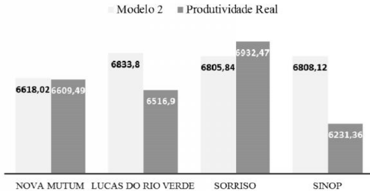
Picture 2. Comparison amongst estimated yield: Model 2, real yield obtained in the municipalities, harvest of 2014/2015

In terms of water conditions based on real yield (PR), which linked to the relative yield downfall ( 1 - PR/PPF ) with the relative deficit of evapotranspiration ( 1 - ETR/ETc ). Observing the real yield data (Table 4), It is noted that the municipality of Lucas do Rio Verde was the one which lost the most of its yield in regard of water effect, followed by the municipality of Nova Mutum which was the least to attain the real yield.