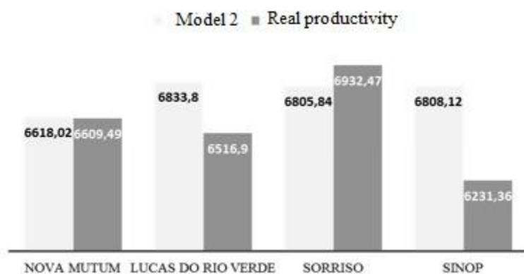
Picture 2. Comparison amongst estimated yield: Model 2, real yield obtained in the municipalities, harvest of 2014/2015

In terms of water conditions based on real yield (PR), which linked to the relative yield downfall ( 1 - PR/PPF ) with the relative deficit of evapotranspiration ( 1 - ETR/ETc ). Observing the real yield data (Table 4), It is noted that the municipality of Lucas do Rio Verde was the one which lost the most of its yield in regard of water effect, followed by the municipality of Nova Mutum which was the least to attain the real yield.