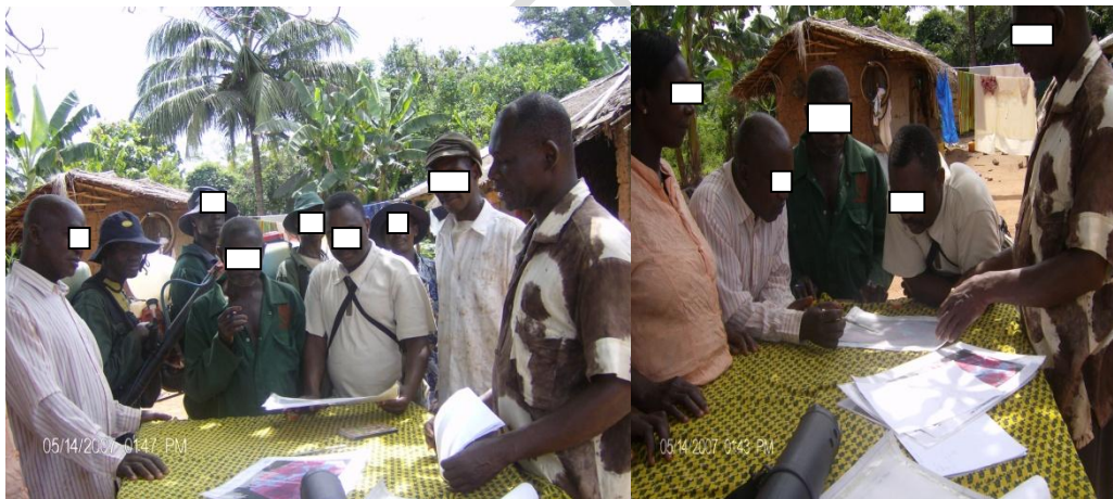
Fig. 3 Workshop with group of farmers

Farmers were interviewed in their farms regarding the way they manage their land, land tenure system, cultivation practices, capital intensity, and labour intensity as the key attribute of their land utilization types. The questionnaire that was administered guided the interview in attaining the necessary information on the key attributes. Farmers were interviewed in their farms, at every point where the interview was conducted soil samples (bulk sample) were taken and the x and y coordinates were recorded from a Geographic Position System (GPS) together with the farmers answers to the questionnaire. The interviews also indicated farmers' perception of assessing their soils suitability for cocoa, citrus and oil palm cultivation. Soil names were based on multiple criteria including texture, colour, consistence and stoniness. With the purpose of creating maps that represent farmers' perception of soil within their land units and their potentials for crop cultivation, a workshop was organized for some selected farmers. The farmers verified and validated the information on the various soils within the land units that was obtained from individual farmers during the interview. During the workshop farmers synchronized and characterized the soil units and also ranked crops on the various types of soils according to their yield performance. They also pointed out the limitations of the various soils to the land use types.