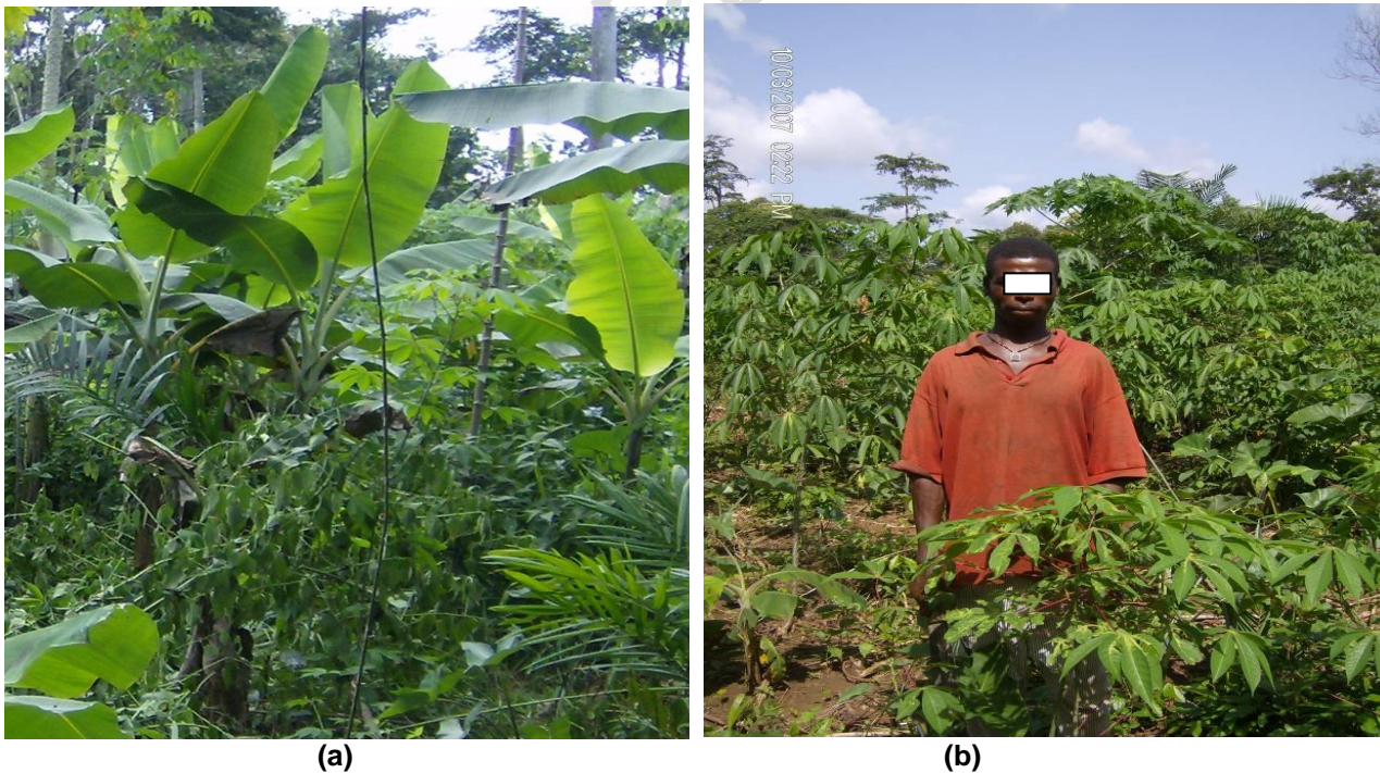
Fig. 2: Oil palm intercropped with food crop b) Cocoa intercropped with food crop

Most farmers in the study area own the Land and the average farm holdings are 4.9 hectares. The commonly cultivated crops are cocoyam, plantain, banana, cassava, maize, cocoa, oil palm and citrus. Farmers cultivate mixed food crops which dominate in the first few years of perennial crops such as cocoa, oil palm and citrus. Figure 2 shows how oil palm and cocoa have been intercropped with food crops.