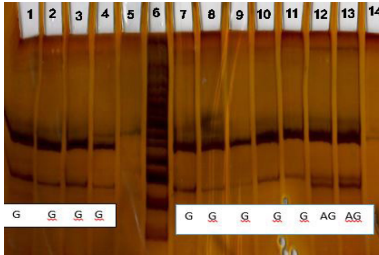
Figure 2: Sequence polymorphism analysis of a Tetra-ARMS-restricted fragment of the DISCI gene in the RS12133766 region after enzymatic digestion using a BseLI restriction enzyme, 6: 50 bp DNA marker (Sinaclon), well 5: negative control, wells 1 to 4 and 7 to 11: homozygous GG and wells 13 and 14 indicate heterozygote AG related to schizophrenic patients

marker, (Sinaclon Co.), well 13: the heterozygote CT and the rest of the wells (wells 1-12) associated with homozygous CC in schizophrenic patients