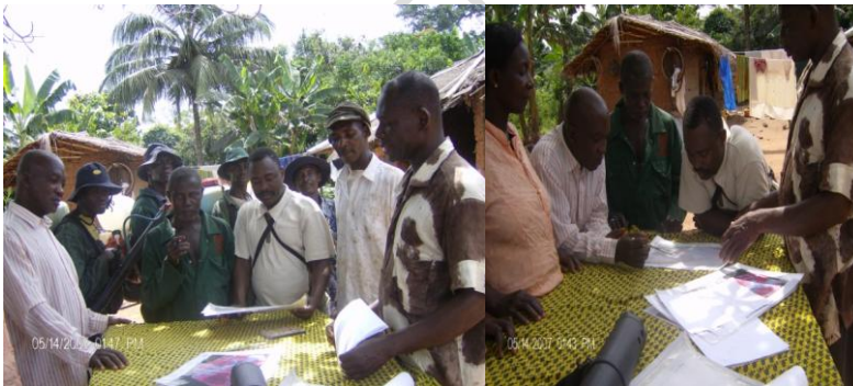
Fig. 3 Workshop with group of farmers

Farmers were interviewed in their farms regarding the way they manage their land, land tenure system, cultivation practices, capital intensity, and labour intensity as the key attributes of their land utilization types. The questionnaire that was administered guided the interview in attaining the necessary information on the key attributes. Farmers were interviewed in their farms, at every point where the interview was conducted soil samples (bulk sample) were taken and the x and y coordinates were recorded from a Geographic Position System (GPS) together with the farmers answers to the questionnaire. -The interviews also indicated farmers' perception of assessing their soils suitability for cocoa, citrus and oil palm cultivation. Soil names were based on multiple criteria including texture, colour, consistence and stoniness. With the purpose of creating maps that represent farmers' perception of soil within their land units and their potentials for crop cultivation, a workshop was organized for some selected farmers. -The farmers verified and validated the information on the various soils within the land units that was obtained from individual farmers during the interview. During the workshop farmers synchronized and characterized the soil units and also ranked crops on the various types of soils according to their yield performance. They also pointed out the limitations of the various soils to the land use types.