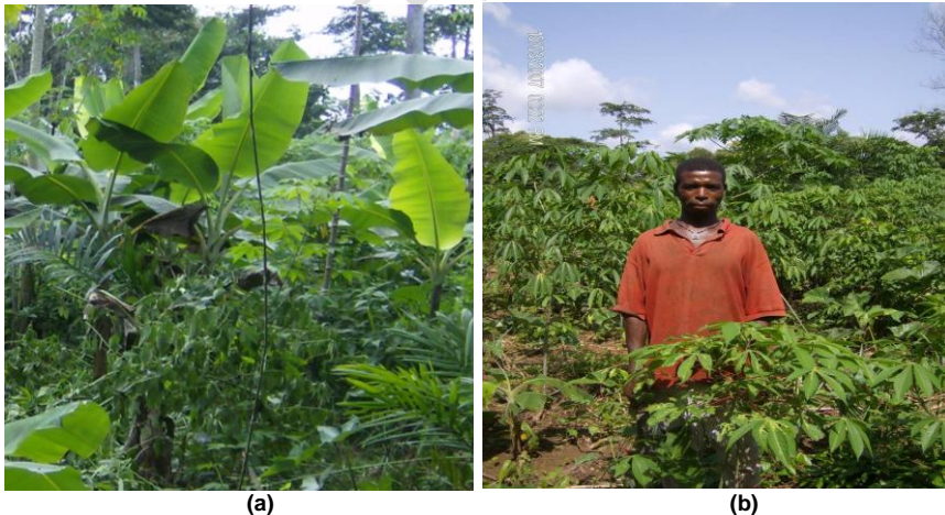
Fig. 2: Oil palm intercropped with food crop b) Cocoa intercropped with food crop

Most farmers in the study area own the Land-land and the average farm holdings are 4.9 hectares. The commonly cultivated crops are cocoyam, plantain, banana, cassava, maize, cocoa, oil palm and citrus. Farmers cultivate mixed food crops which dominate in the first few years of perennial crops such as cocoa, oil palm and citrus. Figure 2 shows how oil palm and cocoa have been intercropped with food crops.