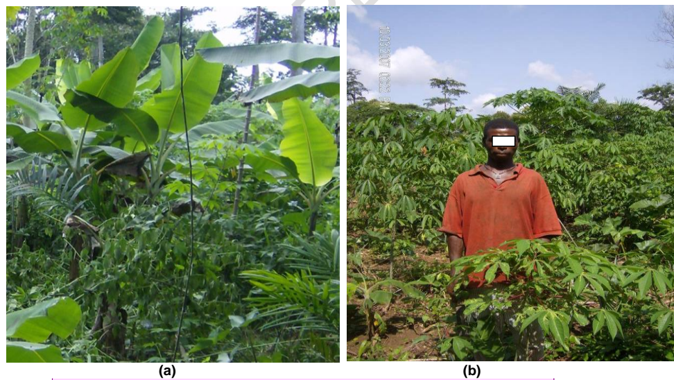
Fig. 2: Oil palm intercropped with food crop b) Cocoa intercropped with food crop

Most farmers in the study area own the Land-land and the average farm holdings are 4.9 hectares. The commonly cultivated crops are cocoyam, plantain, banana, cassava, maize, cocoa, oil palm and citrus. Farmers cultivate mixed food crops which dominate in the first few years of perennial crops such as cocoa, oil palm and citrus. -Figure 2 shows how oil palm and cocoa have being intercropped with food crops.