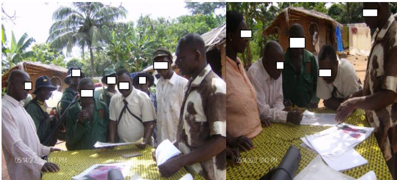
Fig. 3 Workshop with group of farmers

Comment [JK19]: Is the yield performance only based on the soil type or also on the farming system/number of workers etc?