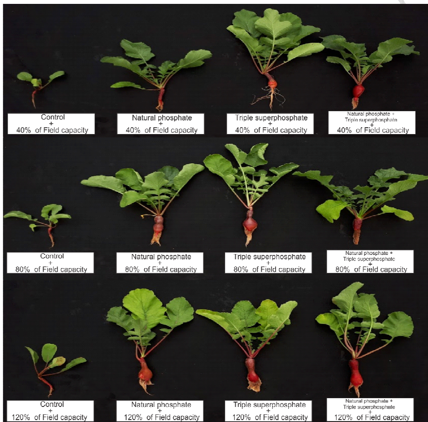
Figure 1. Whole radish plants due to water availability and phosphate fertilization.

For [16], phosphorus deficiency interferes in the leaf area, because there is a limitation in the number of leaves, also affected by water availability for the crop. According to [17], the importance of phosphorus as a nutrient for the development of the crop explains the difference found in the control in relation to the treatments with different sources of phosphorus.