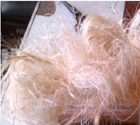
Fig 3: Extracted and Modified Kenaf Blast fiber