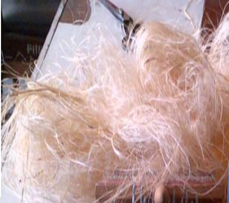
Fig 3: Extracted and Modified Kenaf Blast fiber