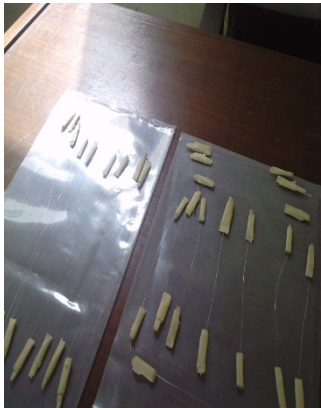
Fig 4: Fiber Sampling