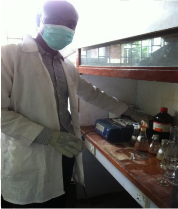
Fig 5: Chemical Modification