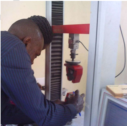
Fig 6: Mechanical Testing (Tensile Strength)