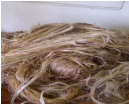
Fig 2: Extracted Kenaf Blast fiber