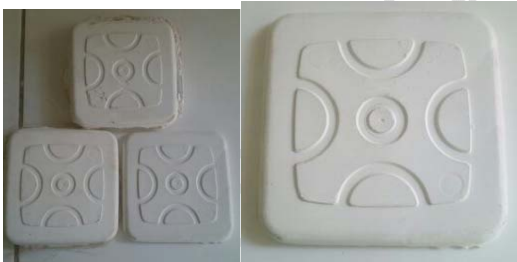
Fig 7: Experimental Products