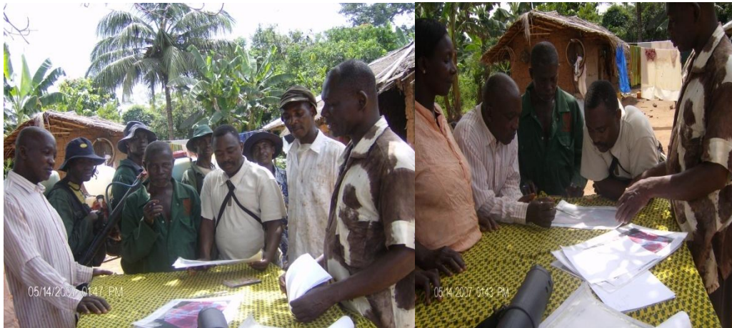
Fig. 3 Workshop with group of farmers