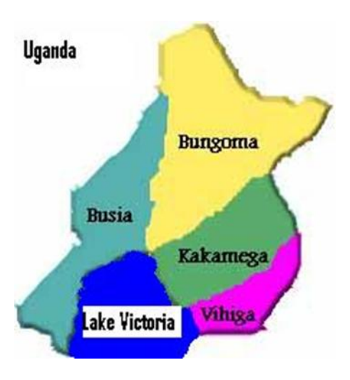
Fig. 2. Map showing the Counties in the Western Region of Kenya

The target population was made up of small scale farmers in the Western Region. The accessible population is as shown on Table 1.