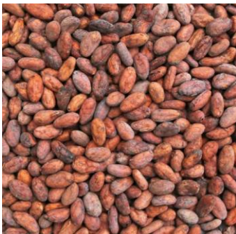
Plate 1: Dry Cocoa Beans

Comment [H4]: Cocoa shell damage processing factory????