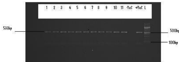
Figure 2: Agarose gel electrophoretogram of mecA Methicilin Methicilin -resistant Staphylococcus S. aureus after PCR analysis which bands at 500 bp.