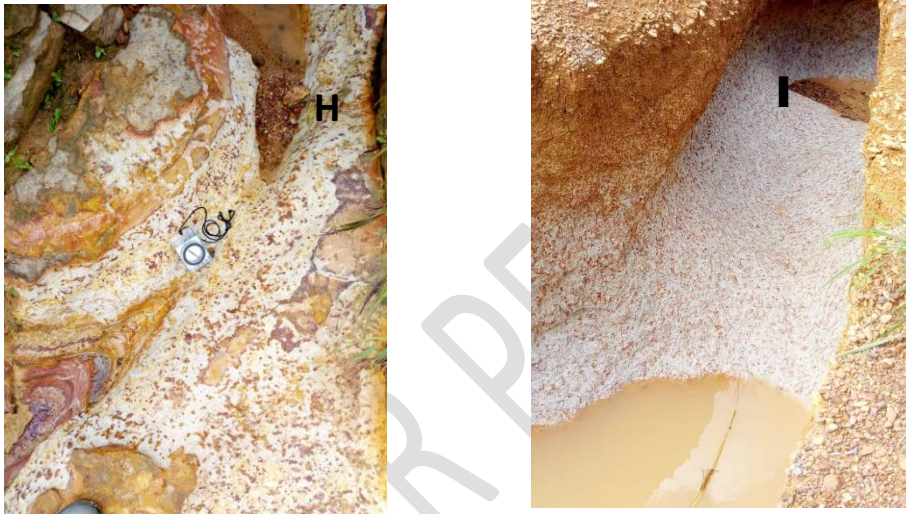
Plate H and I=Shows the kaolinitic clays of the study area (Oziza, Afikpo Basin)