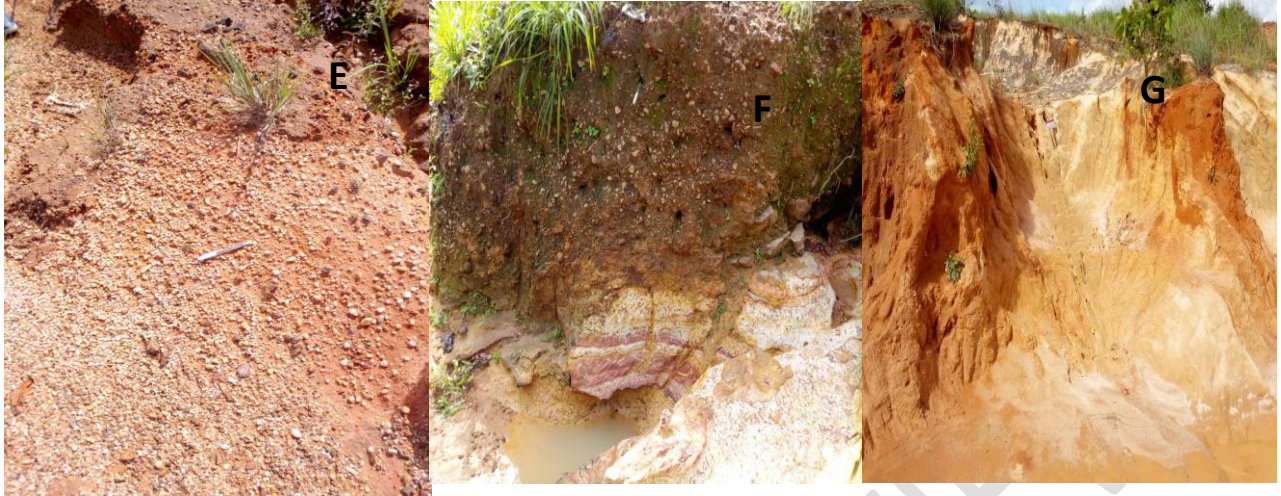
Plate E= Pebbles,F = Pebbly Sandstone having sharp contact with Kaoline and G= Sand, outcrops occurred at Oziza, Afikpo Basin